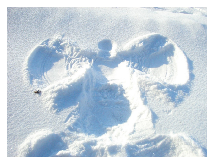
When life gives you too much snow .....

Wednesday, March 13—host Lenten Fellowship Meal and Lenten Service— starting at 5:30 pm